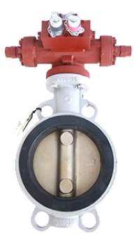
Double acting hydraulic actuator

Oceantech Shipping & Trading Ltd is the Official Distributor for the Greek & Cypriot Market for Shanghai Rongde Engineering & Equipment Co. Ltd,, a company which integrates scientific research and production engineering. The company is actively committed to research and development of new products, and insists on the continuous introduction of new product groups with high technology content, high market share, high added value and independent intellectual property rights.