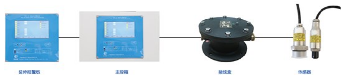
Magnetostrictive liquid level sensor

The float type liquid level measuring device can be used not only for ballast water tanks , fuel oil tanks, draft meters ,but also for measuring the liquid level of the cargo tanks, displaying temperature and steam pressure, and also issuing an alarm signal when the value exceeds the set limit.